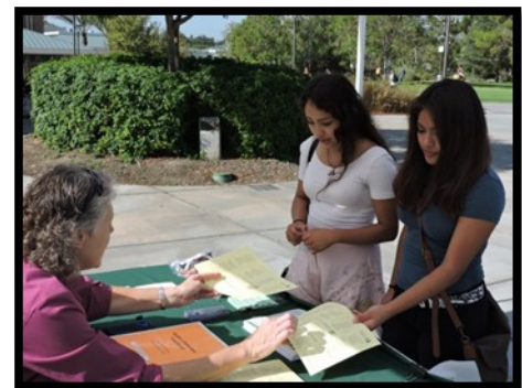
Week of Welcome at Grossmont College.